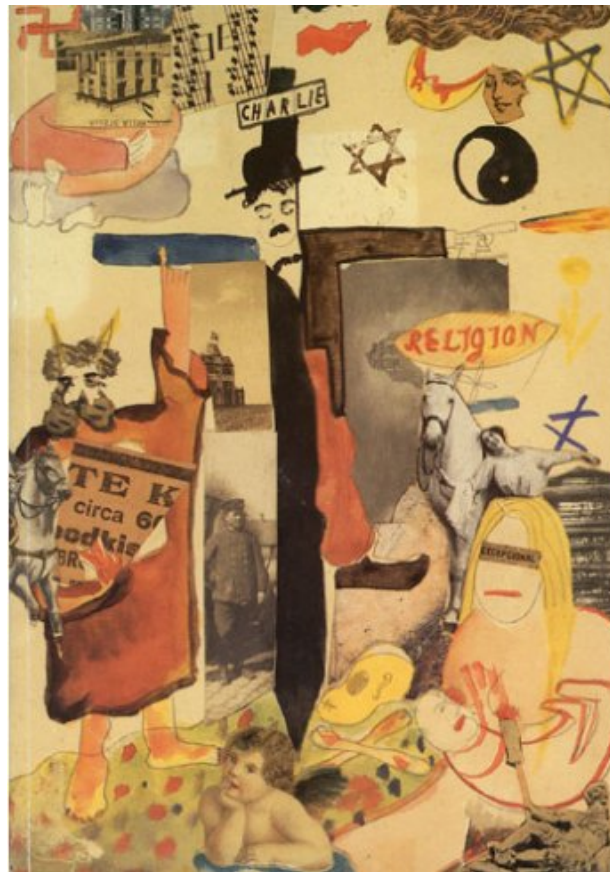
Dada Collage (Charlie Chaplin) , Erwin Blumenfeld (1921)

himself in bowler hat and black clothing dancing the “Dada-Trott,” a dance that cannot help but recall the Tramp’s own derby-bedecked displays; Erwin Blumenfeld dubbed himself “President-Dada-Chaplinist” and produced a montage of the slapstick comedian simultaneously lying on and becoming the Christian cross, surrounded by various religious and art icons, including the Star of David and Swastika.