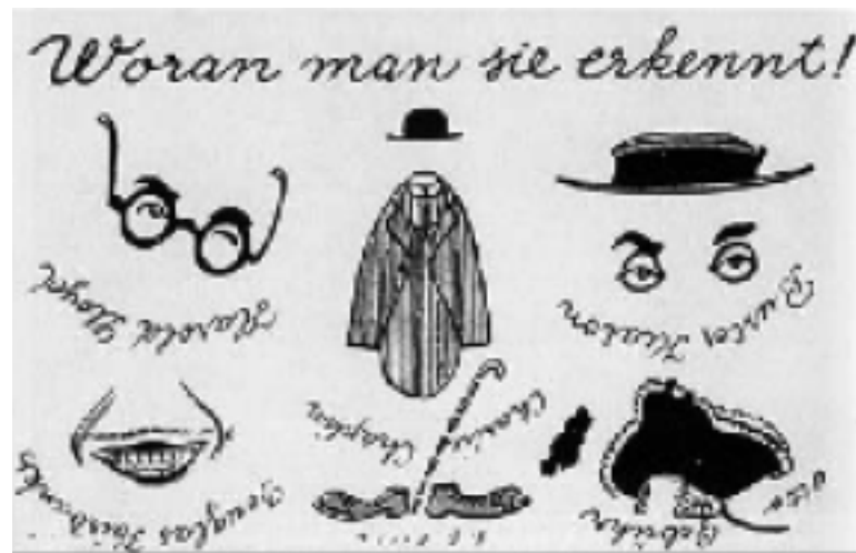
"How to recognize them!"

animation exceed, by virtue of both Chaplin's performance and Ruttmann's framing, control of mind or body to become wish-images evocative in their own right, much like the shoes, cane, baggy trousers, right vest, mustache dot and bowler which made up the Tramp assemblage.