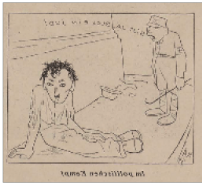
"In the political fight: 'Just a Jew!'" ( Simplicissimus , 1931)

To conclude this reflection on the promise of Chaplin, I'd like to turn to another text by the antinomial Benjamin, one largely forgotten among scholars but happily included in The Promise of Cinema . Like Kracauer's appeal to early Chaplin films' "other possibilities" or Adorno's description of the Tramp appearing as a "ghostly photograph in a live-action film," Benjamin would, in "Chaplin in Retrospect" [Rückblick auf Chaplin] (398-400), emphasize the spectral, anachronistic quality of Chaplin and his cinema in The Circus (1928), made on the cusp of Hollywood's conversion to synchronized sound. Approaching this film as itself a kind of retrospective overview of the filmmaker's "greatest themes," Benjamin also offers an unwitting Rückblick on the many discussions of Chaplin circulating throughout The Promise of Cinema : Chaplin's films as idea-driven, the filmmaker's technical sophistication, speculations about future films like the recently announced Napoleon (basis for The Great Dictator ), biographical tidbits, a valorization of laughter, political interpretations of the Tramp, an emphasis on the Tramp's popularity among diverse global audiences etc. Yet it is the beginning of this Rückblick that is perhaps most intriguing, especially in light of the no less retrospective, redemptive gaze occasioned by The Promise of Cinema .