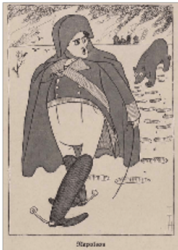
Napoleon (Simplicissimus, 1926)